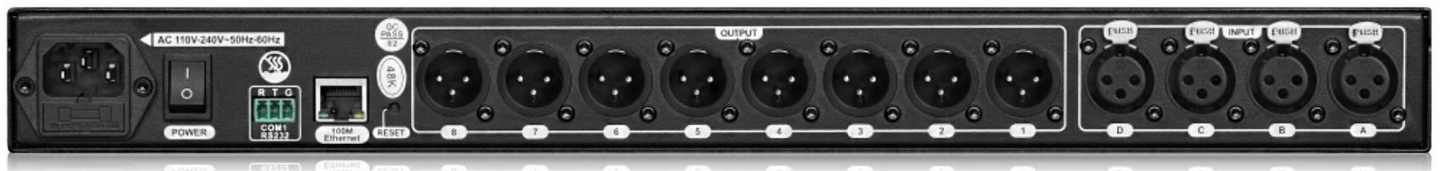
Rear view of the model PRO 48K (4 in - 8 out)

State-of-the-art professional digital processors with compact and lightweight design. High end performance thanks to the inclusion of First-class components, offering high efficiency and energy saving which reduces the operation cost.